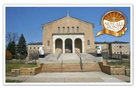
Recalling, Reclaiming, Renewing