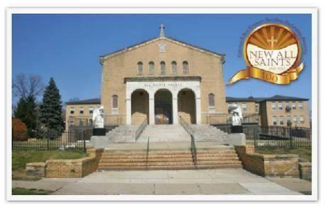
Recalling, Reclaiming, Renewing