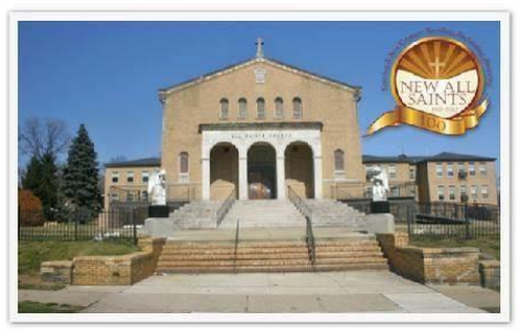
Recalling, Reclaiming, Renewing